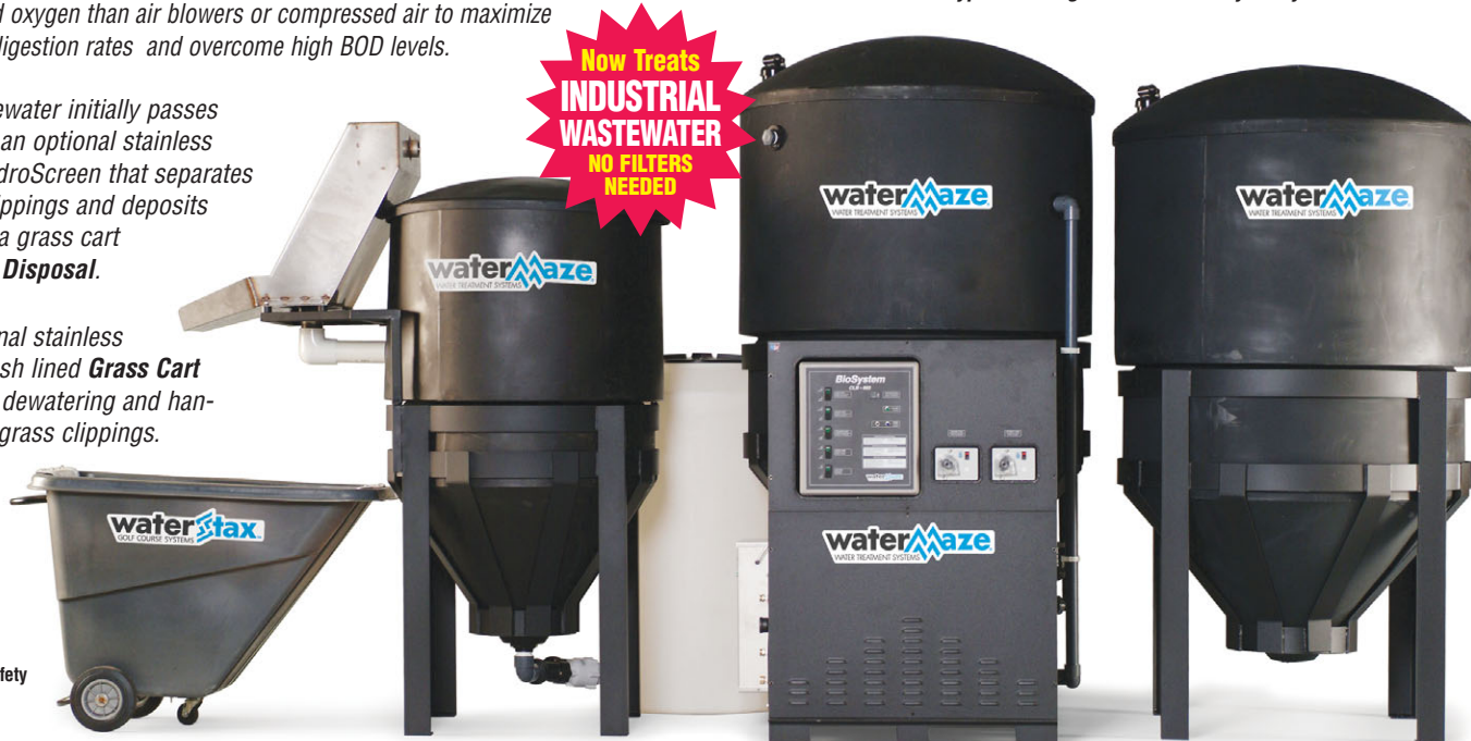
Optional cart for easy disposal of grass clippings